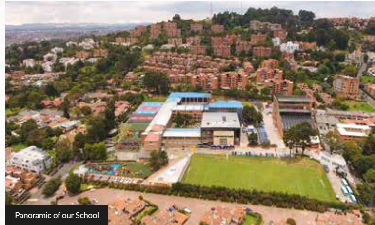
Panoramic of our School