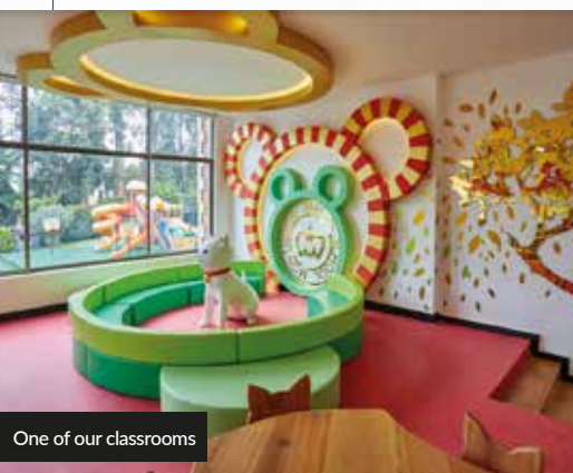
One of our classrooms