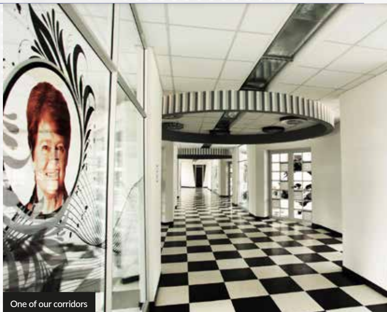
One of our corridors