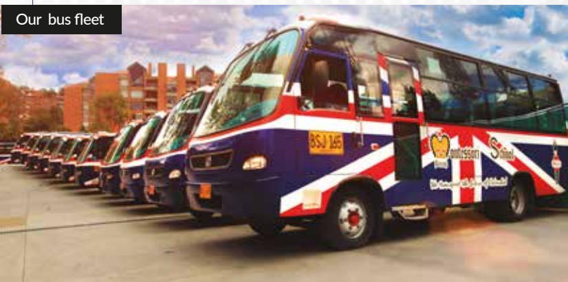
Our bus fleet

Only by cooking healthy food will we be able to heal the world and ourselves.