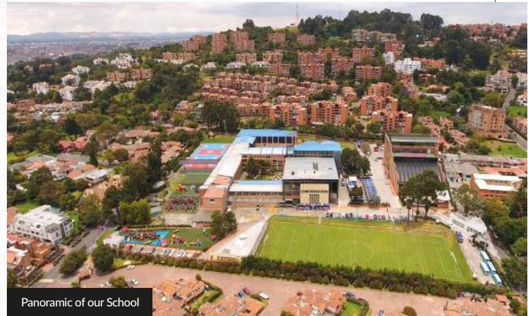
Panoramic of our School