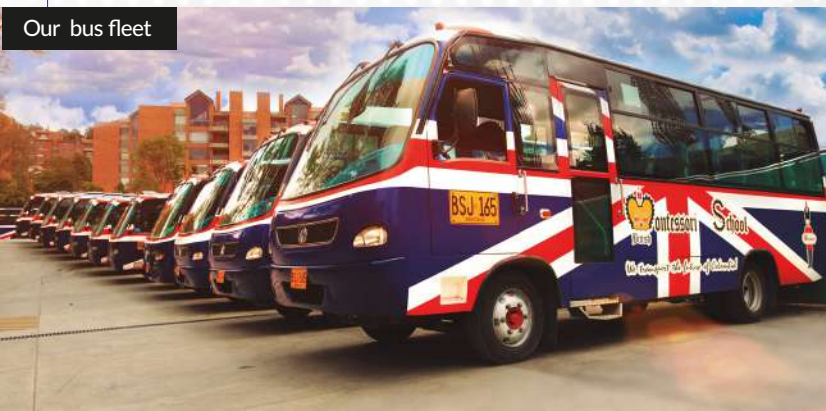
Our bus fleet

Only by cooking healthy food will we be able to heal the world and ourselves.