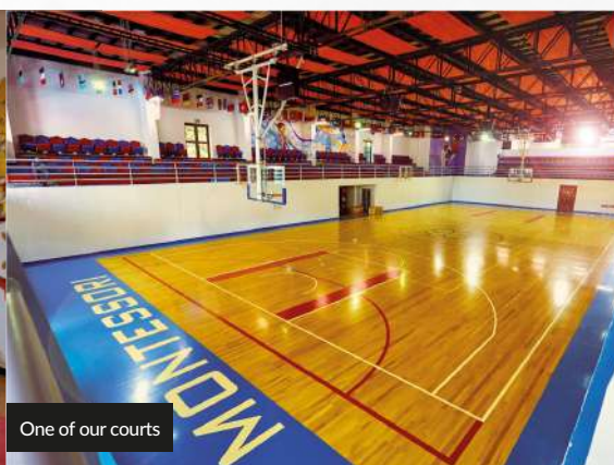
One of our courts