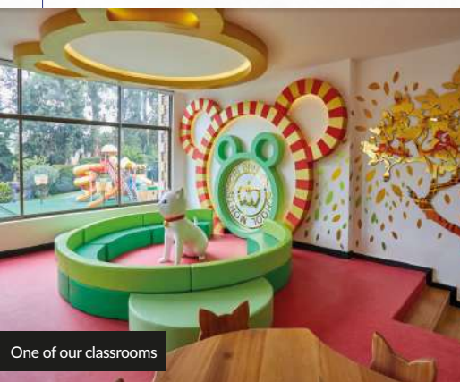
One of our classrooms