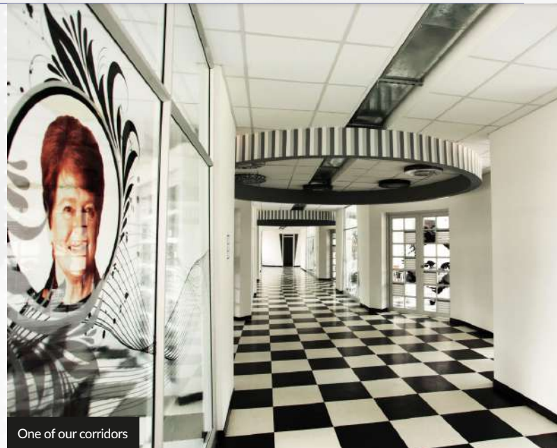
One of our corridors